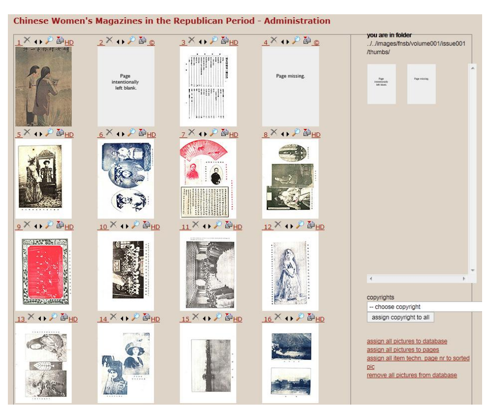
Fig. 3: Back-end interface to arrange pages, fill missing or blank pages, and assign copyright information.