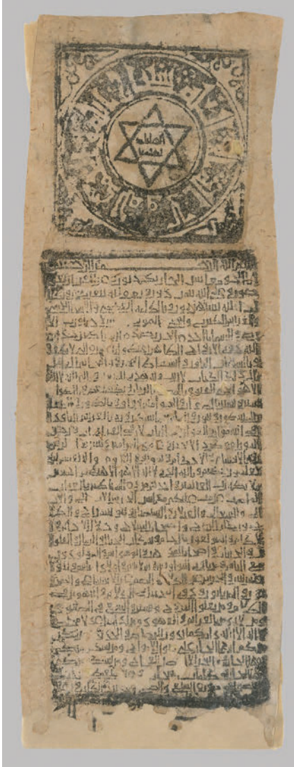
Fig. 9: Talismanic scroll from Egypt(?) (ca. 11th century CE)