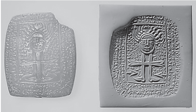
Fig. 2: Sasanian Seal-amulet, ©Metropolitan Museum of Art, New York (Acc. no. 1989.123).

SKJÆRVØ's, suggests that the amulet is "attributed to the god Sāsān". 20 If Sāsān – or rather Sesen 21 – thus addresses a demon, a "Lilith-like entity", 22 this would be a functional parallel to later Islamic practices (against illness-demons, maybe threatening women in childbirth). 23