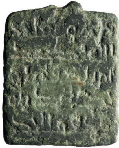
Fig. 4: Early Islamic amulet (reverse); ©Universität Hamburg, Islamic Studies , Photo Archive (Inv.no. SB 10754).

very similar to the figure represented on the Hamburg amulet's obverse. 28 The depictions within this category have in common the fact that they all display a figure, either naked or dressed, often ithyphallic and bound to two staves, one to its right and the other to its left (Fig. 5).