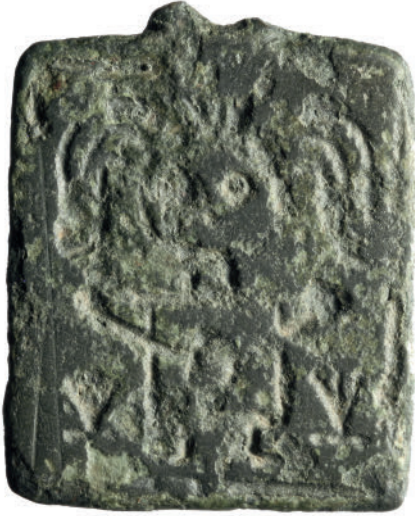
Fig. 3: Early Islamic amulet (obverse); ©Universität Hamburg, Islamic Studies , Photo Archive (Inv. no. SB 10754).