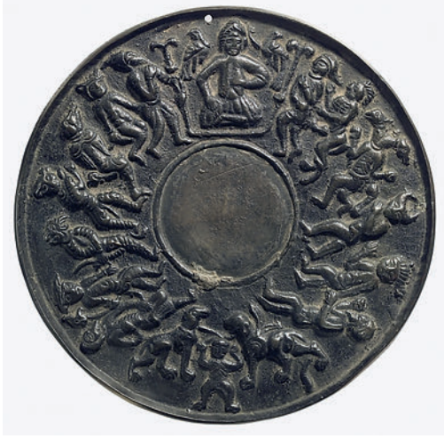
Fig. 8: Bronze mirror (ca. 12th–13th century CE), (Acc. no. 1978.348.2).

Next to the hoopoe, which is Sulaymān’s ‘trademark’ item, we also observe a stave on each side of the throne. As with the Sasanian anthropoid figure, animals – but also jinn – may surround the monarch and his throne (two lions may sit beneath it), and sometimes, attendants can be observed. 43 It seems the staves – the ends of the thrones – are usually surmounted by animal-heads (birds); in some cases, the figure holds a cup in his hand. 44 This cup could represent the famous jām-i Sulaymān (“bowl of Sulaymān”), through which Sulaymān again is connected to more ancient Iranian traditions (the bowl of Jamshid). 45 It