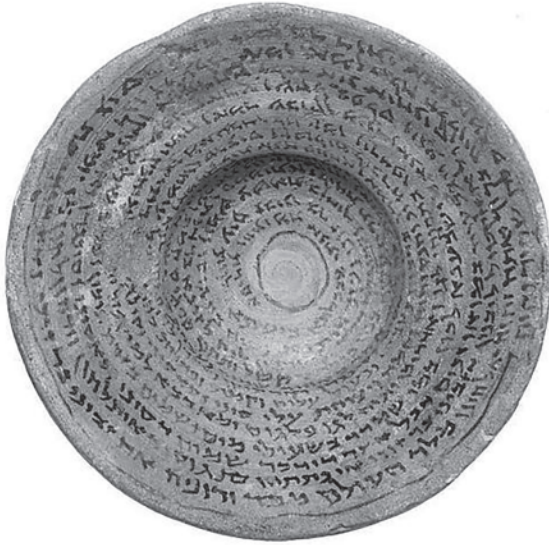
Fig. 1: Incantation bowl with Aramaic inscription (ca. 5th–6th century CE), (Acc. no. 86.11.259).