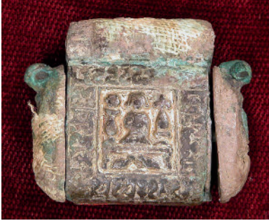
Fig. 6: Early Islamic amulet from Iran, ©Metropolitan Museum of Art, New York (Acc. no. 1978.415).

nian iconography. 32 While Sasanian and Early Islamic depictions of the originally standing and later sitting figure leave little doubt that they are closely connected to each other, the interpretation of the person sitting cross-legged on the (often H-formed) throne remains somewhat puzzling.