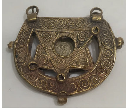
Fig. 10: Earring from Iraq(?) (ca. 11th–13th century CE), ©Metropolitan Museum of Art, New York (Acc. no. 95.16.2).