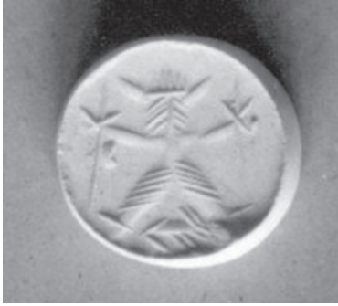
Fig. 5: Sasanian stamp seal, Iran or Iraq (ca. 3rd–7th century CE), © Metropolitan Museum of Art , New York (Acc. no. 93.17.7).

details, GYSELEN identifies different forms of this representation as demon, archdemon or Gayōmard (this last interpretation finally goes back to Phyllis ACKERMAN). 30 According to this interpretation, it seems probable that the figure on the Hamburg amulet is, following the Sasanian iconographic tradition, bound by two means: it is both fettered to staves and surrounded by an imprisoning frame.